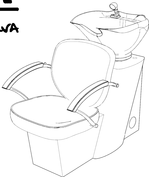
Aston Backwash System Model #5816